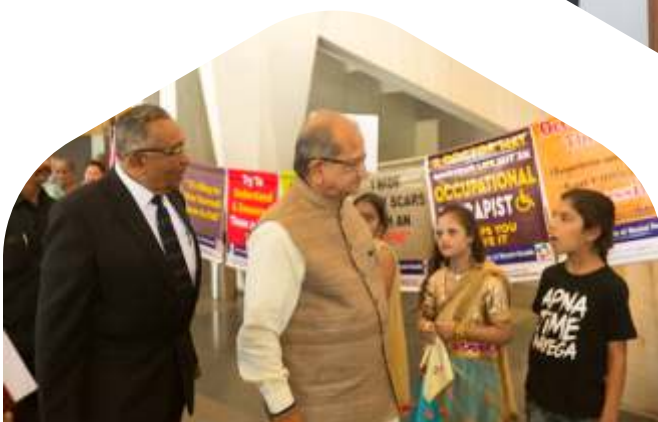
Shri Bhupendrasinh Chudasma Education Minister, Gujarat